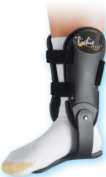
The Richie Brace® OTC Dynamic Assist